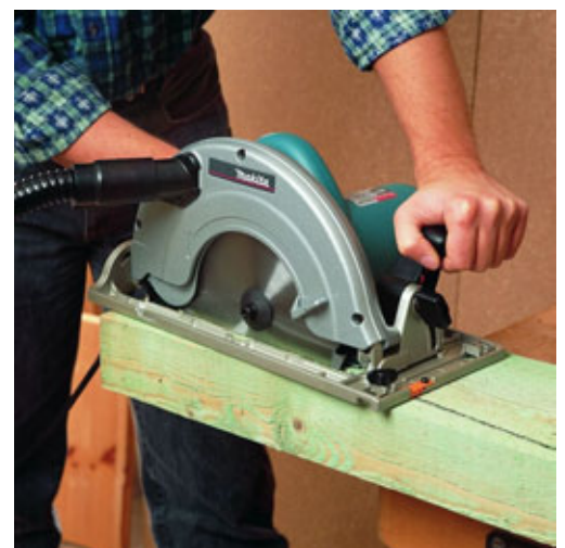
Photographs : Model 5903RK