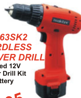
MT063SK2 CORDLESS DRIVER DRILL 2 Speed 12V Driver Drill Kit 2x Battery