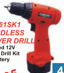
MT061SK1 CORDLESS DRIVER DRILL 1 Speed 12V Driver Drill Kit 2x Battery