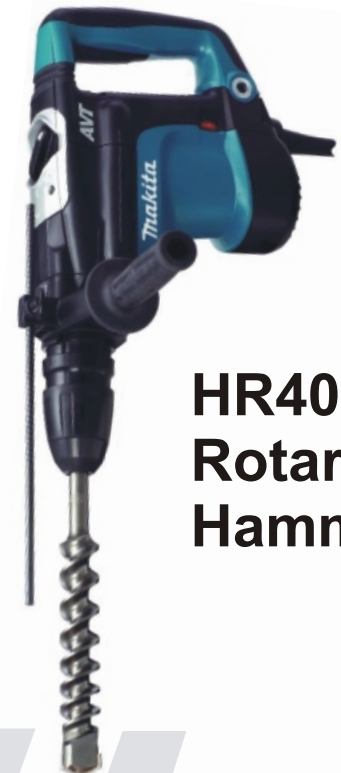
HR4011C Rotary Hammer