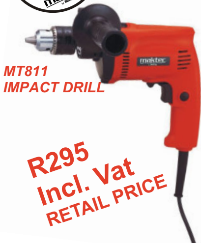
MT811 IMPACT DRILL