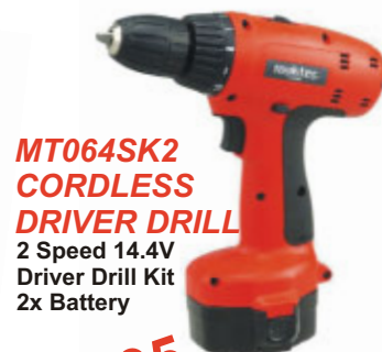
MT064SK2 CORDLESS DRIVER DRILL 2 Speed 14.4V Driver Drill Kit 2x Battery