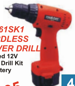
MT061SK1 CORDLESS DRIVER DRILL 1 Speed 12V Driver Drill Kit 2x Battery