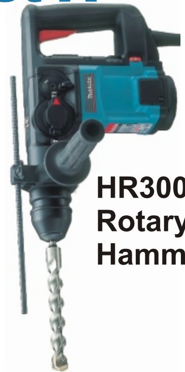
HR3000C Rotary Hammer

To get a better picture of how well these tools perform, it is important to note their day-to-day performance as well as to create a more objective hands-off drilling test. The way a tool feels in your hands is subjective, but anyone familiar with power tools knows that often the feel of a tool is a reliable indicator of quality. Better tools look solid, feel solid, and operate powerfully and smoothly. And when it comes to rotary hammers, lower vibration translates to less user fatigue. Not only is the HR4011C powerful with a 1,050W motor and 6.7 joules of impact energy, but it also has synchronized RPM (230 - 450) and BPM (1,350 - 2,750) to prevent overlapping impacts for up to 50% more efficient drilling. A variable speed dial with 5 different preset speeds and electronic speed control minimizes speed loss for 28% faster drilling. The HR3000C has a continuous rating input of 850W with a no load speed of 360-720 revs per minute. Its blows per minute is 1,650-3,300. Overall features of the HR4011C such as externally accessible brushes, for quick and simple job-site servicing, and the one-touch sliding chuck, for easy bit changes, make this tool more efficient to use and easier to operate and service. The Makita HR3000C is well designed and it's in a class of its own when it comes to drilling speed.