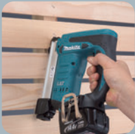
1 2 3 Depth Adjusting