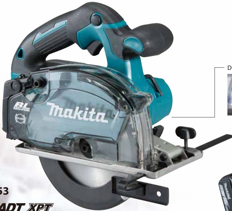
Dual LED Lights