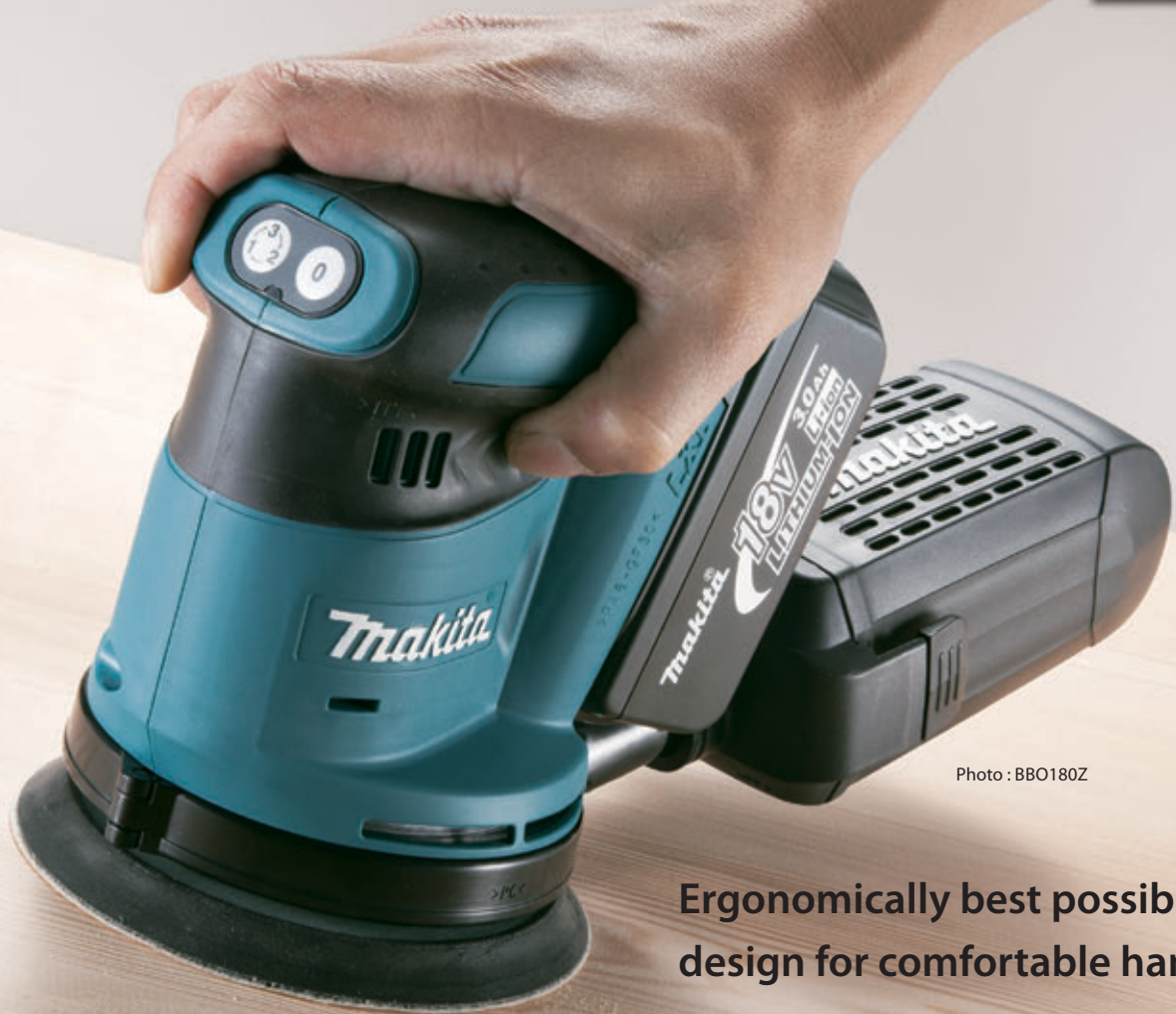
Photo : BBO180Z

Ergonomically best possible grip design for comfortable handling